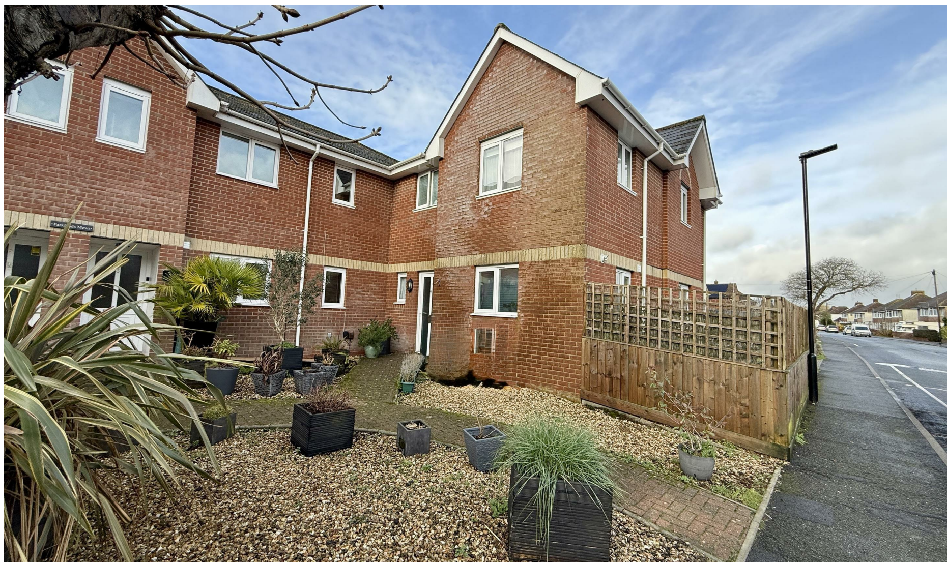
4 Parklands Mews, Parklands Avenue, Cowes £280,000